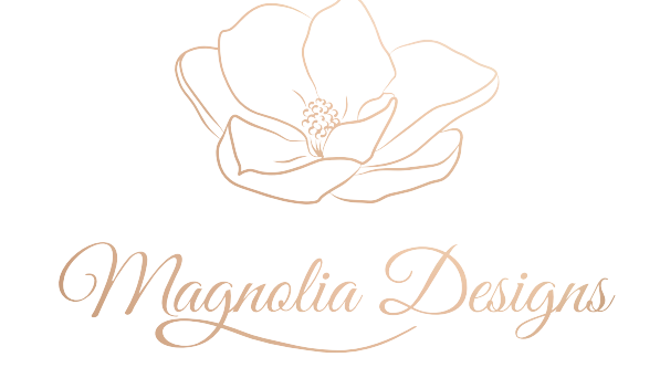
Designer - Goldsmith - Pearl Grader - CAD